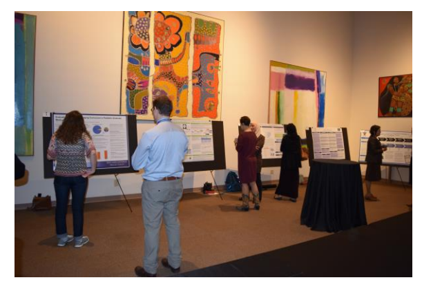
Second annual SoTL Symposium

In 2014 the Center hosted its first symposium to highlight SoTL work from SLU faculty and graduate students. In response to a campus-wide call for submissions in 2015, we hosted our second SoTL Symposium, featuring 16 posters from 32 SLU faculty and graduate student researchers. The Symposium was held in conjunction with the James H. Korn Award ceremony. In all, approximately <u>40 faculty and</u> <u>graduate students</u> attended the event. To read more about the Symposium, including a list of the presenters and projects highlighted, see the <u>SoTL Symposium page</u> on our website.